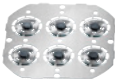
Magnetic Anchor Seal

Millions of people owe their lives to dialysis. There are more than 180 hydraulic components in a dialysis machine and almost the same number of potential applications for sealing technologies.