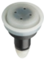
2K Valve Seal