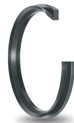
Merkel Enviromatic EA* Innovative water guard, replaces V-rings in demanding applications