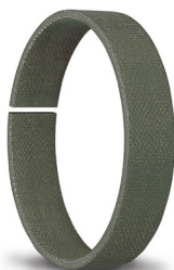
Merkel Guivex SBK and KBK, as well as the types SB and KB. Guide bands made of laminated fabric