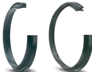
Merkel wiper P 6* and P 9* Featuring support elements or additional sealing function