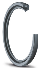
Merkel Radiamatic RPM 41 Radial shaft seal, particularly suitable for work rolls in steel mills

The basic rings come from the series production. Guide bands and V-packings are cut to size and supplied as open versions. A specially developed joining method allows individual diameter specifications for wipers, water guards and radial shaft seals.