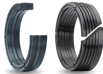
Merkel V-packing set EK resp. ES Particularly for cylinders in existing installations