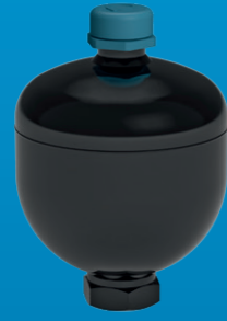
Diaphragm accumulator (Steel shell)