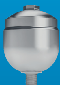
Diaphragm accumulator (Aluminum shell)