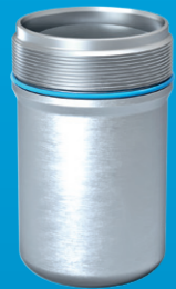
Piston accumulator (Plastic piston)